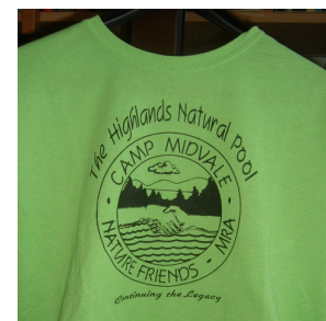
T-Shirt with self-made logo

(At present, the section on the former camp grounds remaining in the hands of ex-Nature Friends is the Highlands Natural Pool. Its construction in the 1930s is documented in the project. Today the Pool is run through an organizational structure which decidedly resembles co-operative patterns – c.f. www.highlandspool.com )