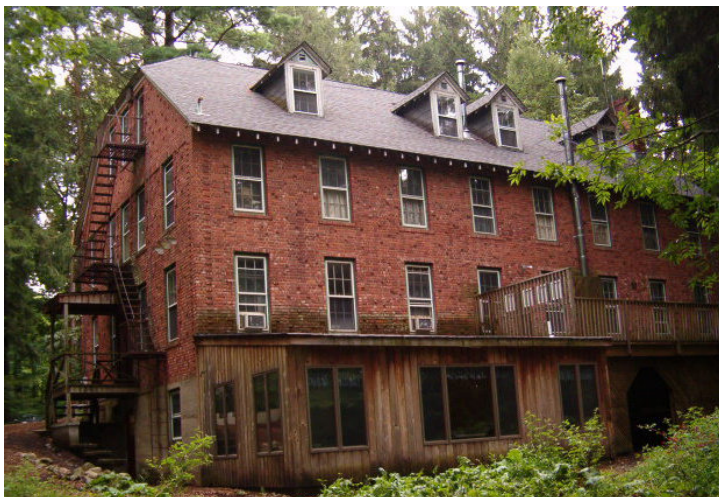
Main Building Weis Center Today (Former Dormitory Building)

The Library's grant project resulted in the following enhancements to its collection: